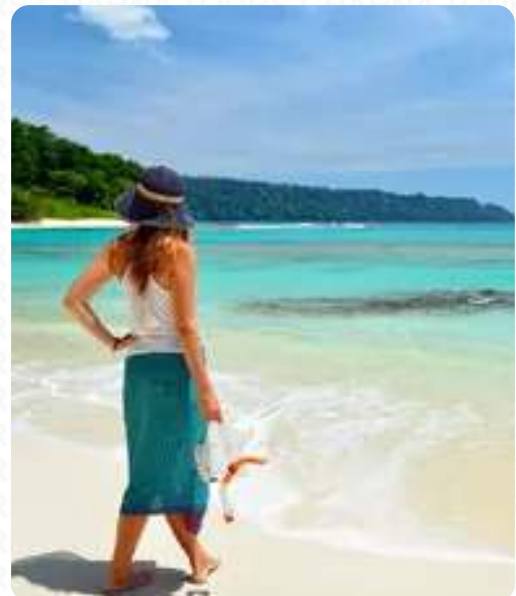
Swim & Bask