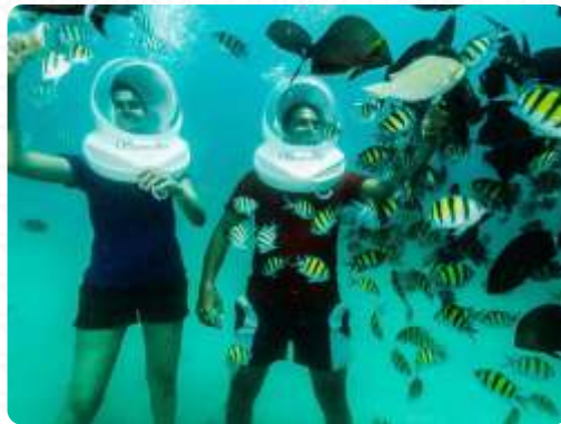
Under Water Sea-walk