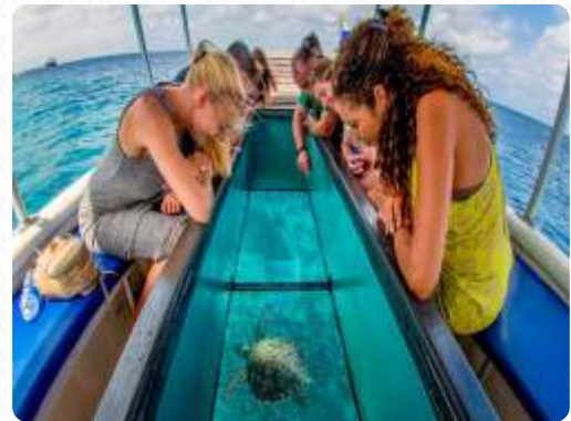
Glass Bottom Boat Ride