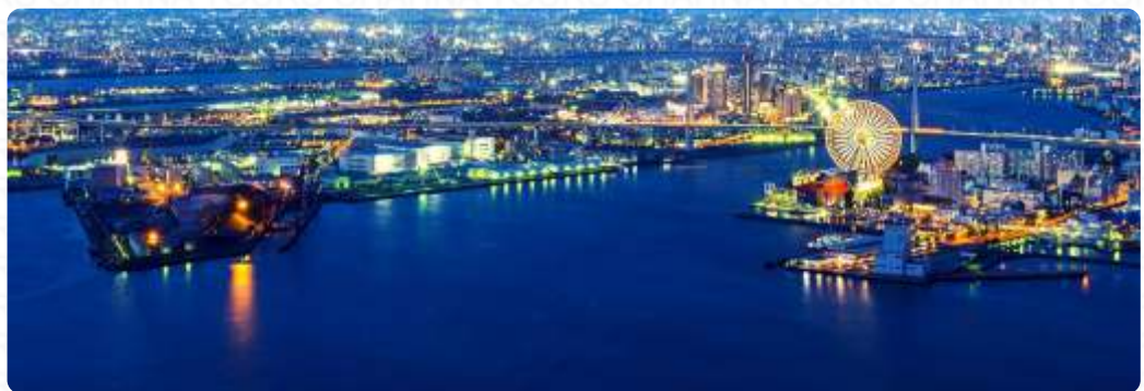
Port Blair City