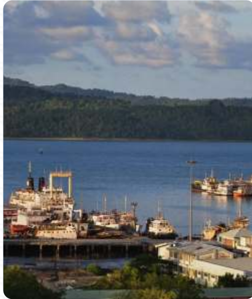
Phoenix Bay Harbour

In the morning from Phoenix Bay Harbour get transferred to Havelock Island via ferry from Port Blair. On arrival at Havelock Island, our representative will receive and escort you to selected hotel. After freshening up, journey towards Radhanagar Beach (Beach No. 7) , the Times Magazine rated it the finest beach among the best beaches in Asia . It is an ideal place for swimming, sea bathing and basking on the sun kissed beach. Stay here overnight amongst sandy beach and lush green forest in a comfortable beach resort at Havelock. Overnight stay at respective Hotel at Havelock.