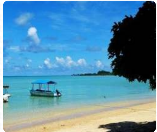
Gupteshwar Mahadev Caves