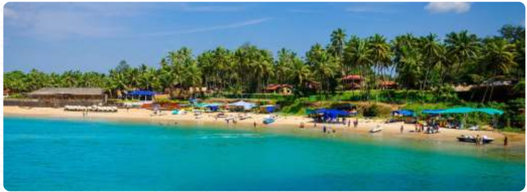
Corbyn's Cove Beach

On arrive at Port Blair, our representative receive you at Airport and escorted you to check in to the Hotel / Resort. After check-in at the hotel In the afternoon proceed for visit to Corbyn's Cove Beach – a coconut fringed beach about 8kms from Port Blair city ideal for swimming, visit to National Memorial Cellular Jail - was built by Britishers in the years 1905 to imprison Indian political freedom fighters , Late evening witness the enthralling Sound and Light Show at Cellular Jail - where the heroic saga of the Indian freedom struggle is brought alive. Overnight stay at respective Hotel / Resort at Port Blair.