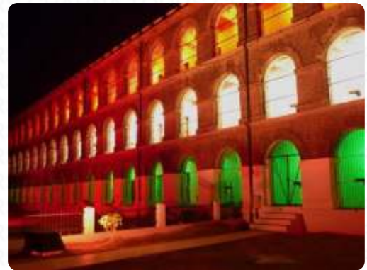
Sound and Light Show